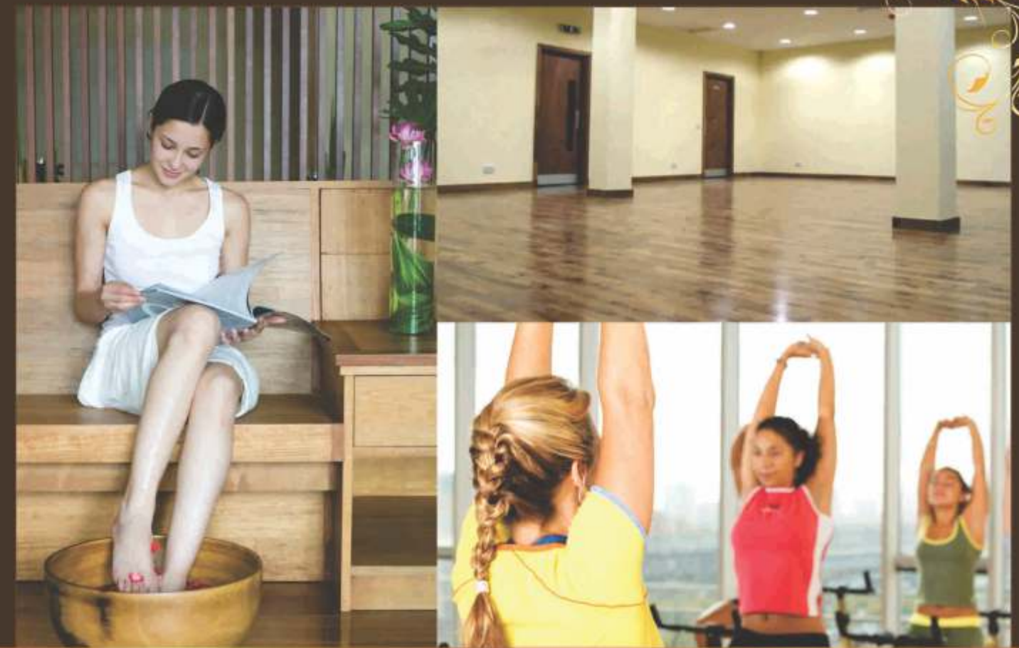
A Community Hall for Recreation

Meridian Crown presents beautiful cooking spaces for those who enjoy preparing delicious & yummy meal in an efficient as well as trendy semi modular kitchen. The granite countertop with stainless steel sink is the best way to improve the functionality of your kitchen. The elegant ceramic tiles have been finished upto lintel level. Cooking will be truly an unique but a pleasurable experience.