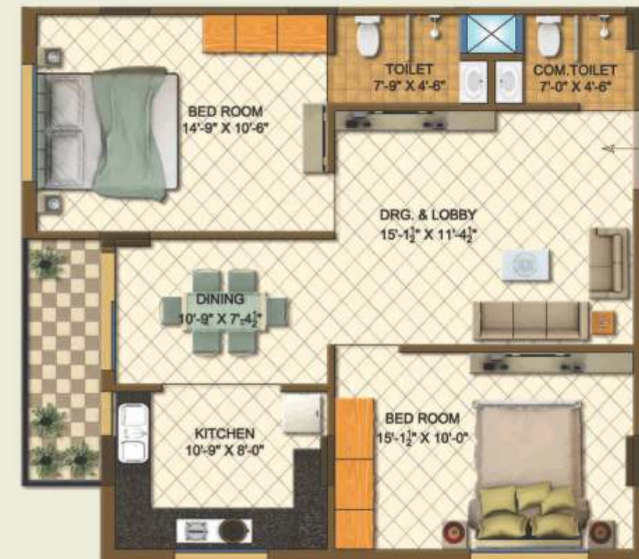
Unit C - 2 BHK