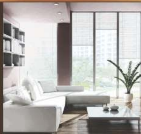
Stylish & Affluent Living Room & Drawing Room

Meridian Crown presents beautiful cooking spaces for those who enjoy preparing delicious & yummy meal in an efficient as well as trendy semi modular kitchen. The granite countertop with stainless steel sink is the best way to improve the functionality of your kitchen. The elegant ceramic tiles have been finished upto lintel level. Cooking will be truly an unique but a pleasurable experience.