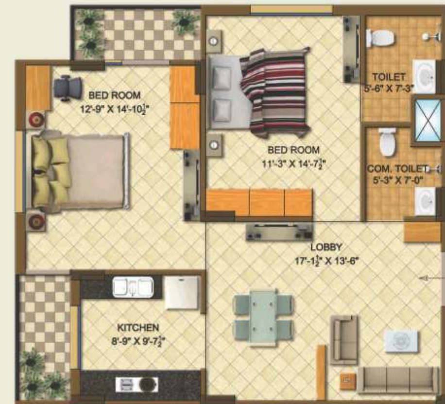
Unit A - 2 BHK

Meridian Crown is a brand new statement of Meridian Group in the line of luxury apartments. It offers magnificent 2 & 3 BHK with latest equipments & appliances of superior quality. The excellent fixtures & fittings gives a classy look. Each room has one textured wall finish that sparks up the aura of the room. Dream sweet with style in your air conditioned master bedroom on a queen sized bed or take pleasure in watching a game of cricket or a movie on your LED TV . Meridian Crown presents an ideal setting for a lavish living.