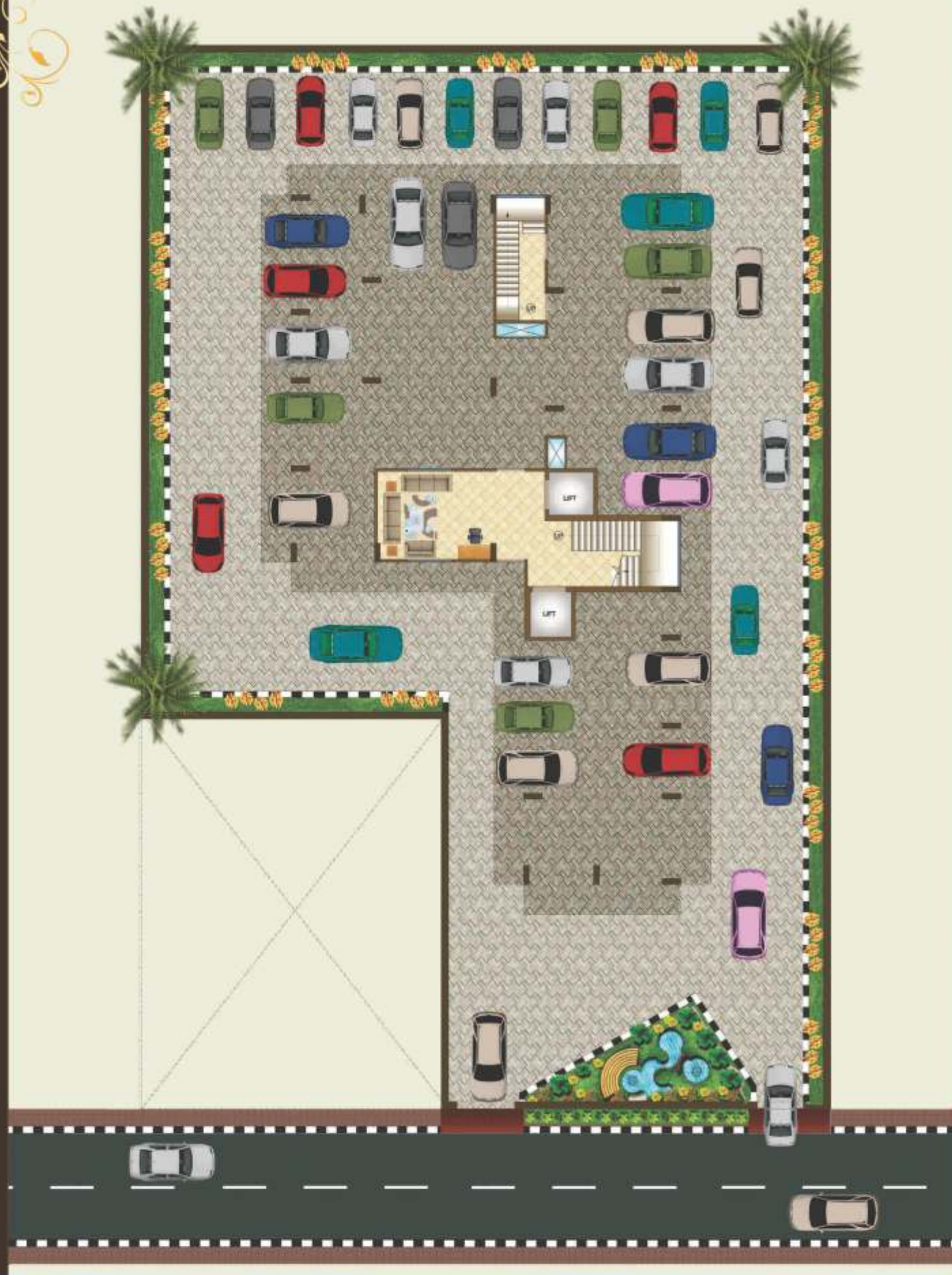
Stilt Floor Plan