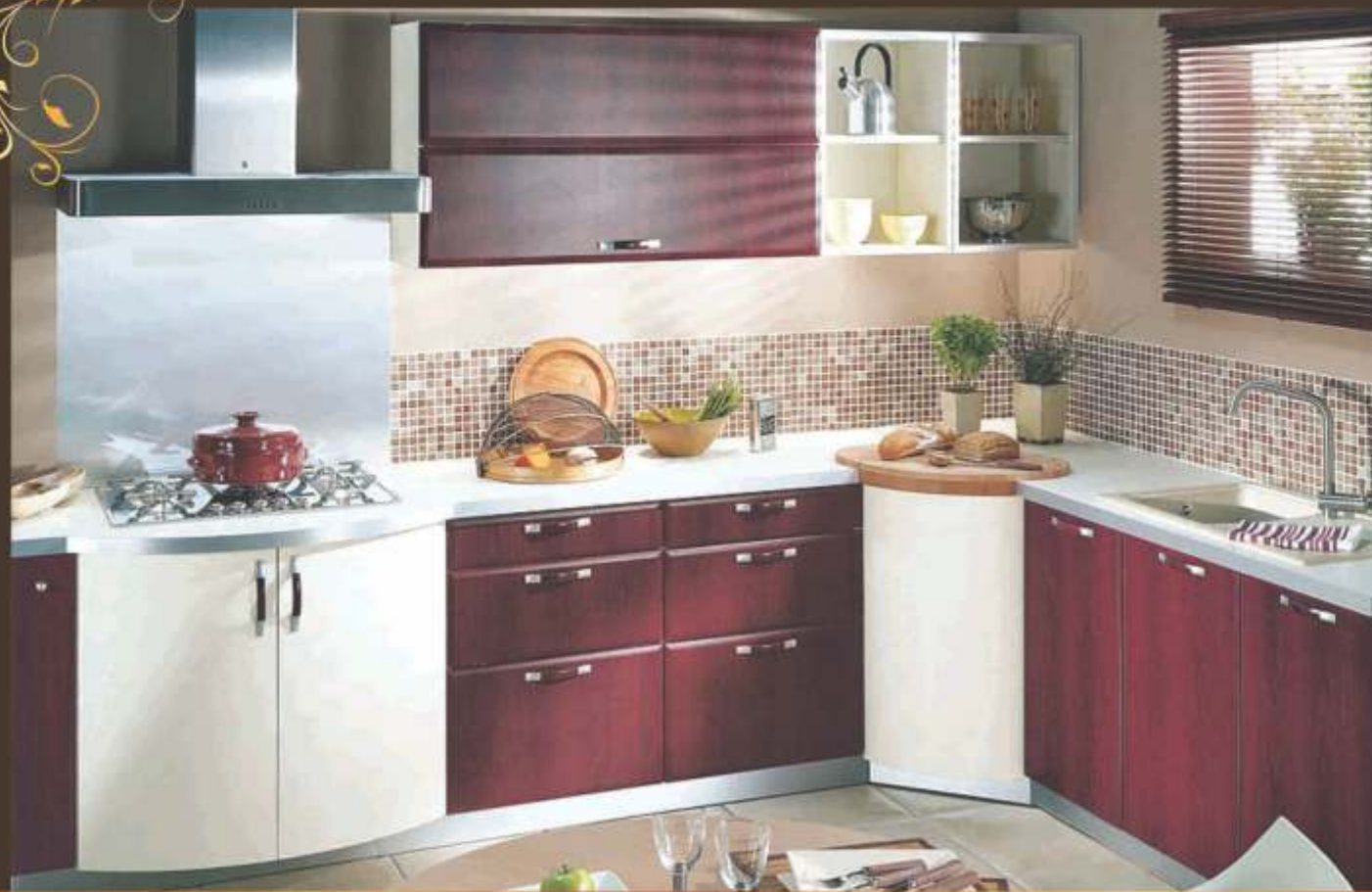
Cooking spaces for delight & comfort